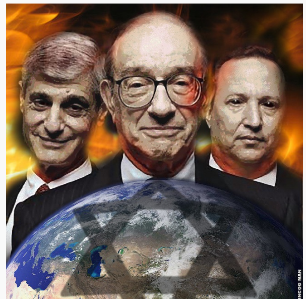
World dominion is their stated goal in the Protocols of Zion, and they're well on their way to accomplishing it.