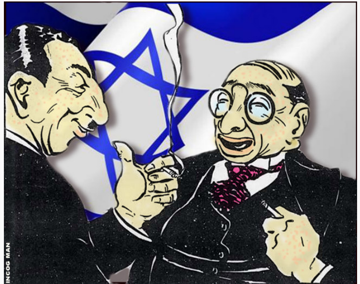
Zionist power brokers were hell-bent on creating Israel as a central organization for their international world swindle.

On October 6, 1940, the New York Times ran an article titled, “ New World Order Pledged To Jews. ” It reported that Arthur Greenwood of the British War Cabinet pledged the Jews a “New World Order” upon the defeat of the Axis Powers in WWII. Greenwood was quoted as saying that in this New World Order the “conscience of civilized humanity would demand that the wrongs suffered by the Jewish people in so many countries should be righted.” He added that after the war an opportunity would be given to Jews everywhere to make a “ distinctive and