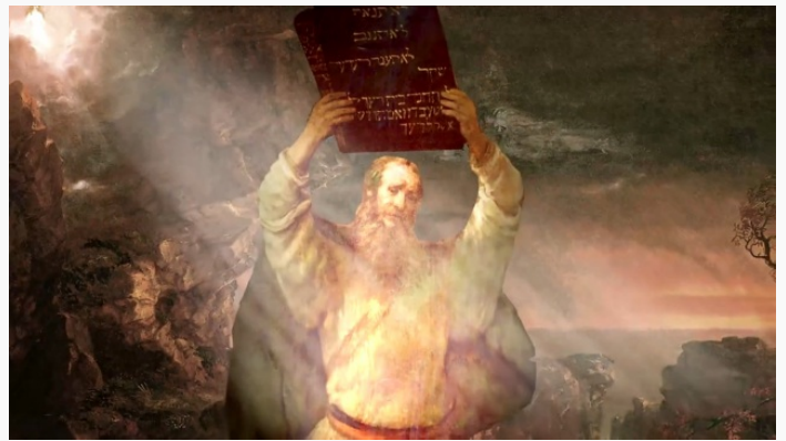
Jews believe that their tribal god Yahweh has declared them a Holy “Chosen People” superior to all others.

Above all, the “Goyim” are not allowed to question “God’s Chosen People” in any capacity. Yet the Chosen Ones are allowed to level any charge, any libel, any mytho-maniacal tall tale concerning the “hateful German Gentiles,” and while they’re doing this we must all sit silently and acquiesce passively or else! So, apparently, they have the right to do this; meanwhile if we accuse the Chosen Ones of perpetrating a slow-motion genocide against the Palestinians , mass murder in Lebanon, Syria, Jordan and Egypt, or of being behind the genocide of millions ten-fold under the yoke of Communism in Russia and Eastern Europe , then we have committed nothing less than the cosmic crime of “blood libel.”